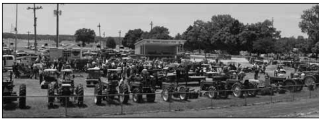
The Expo's machinery auction had many items up for grabs. We look forward to hearing details about the results of the Expo at our October meeting.